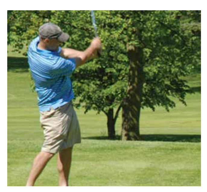
A golfer from the Laven Insurance team follows through with his drive during the TCU/SBAA Scholarship Golf Tournament at Erskine Golf Course.

Contact the SBAA office for more details.