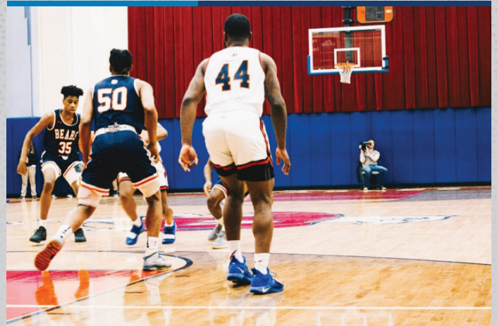
Photo from the Riley vs. Adams Basketball game honoring Central High School

school song along with the band. It was an incredible evening for our community and a great way to honor our oldest school.