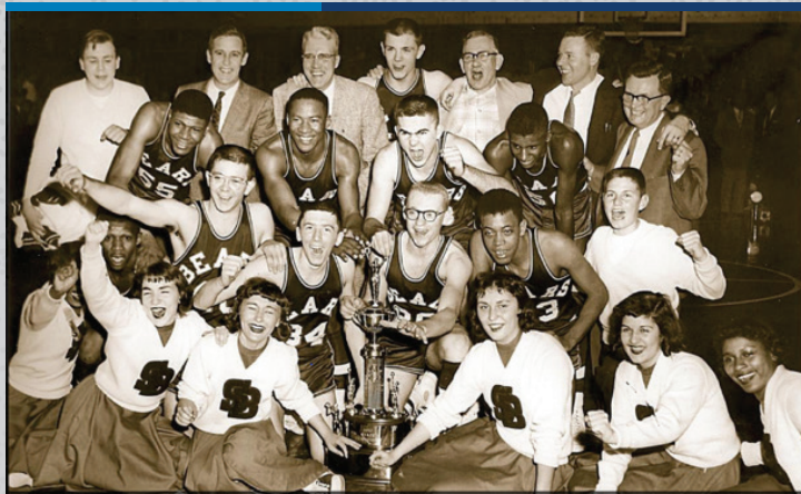
Members of the 1957 boys basketball team celebrating their state championship after a 30-0 season

In 1913, South Bend High School was South Bend's only high school. In 1924, it was renamed South Bend Central and quickly became known for its academics and athletics program. Even though its doors closed in 1970, the spirit of Central still lives on today.