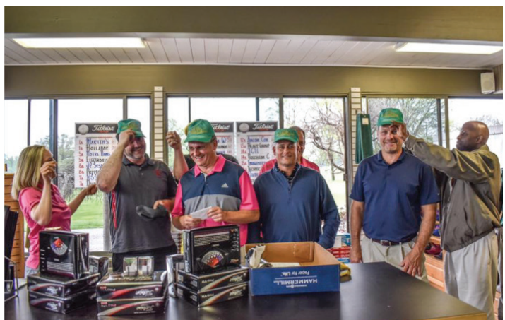
The team taking home top honors and the GREEN HATS this year was Precision Wall Systems, Inc.