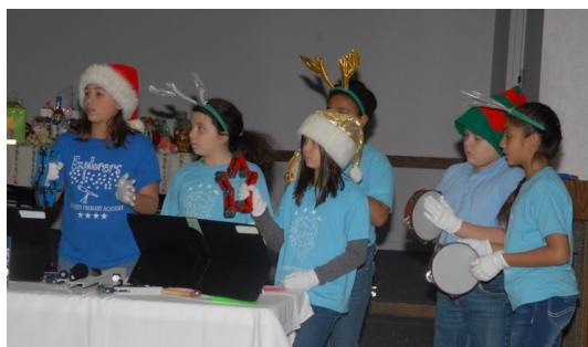
Fourth-graders from Kennedy Primary Academy's Bell Choir perform a Christmas tune at the December Lunch Club.