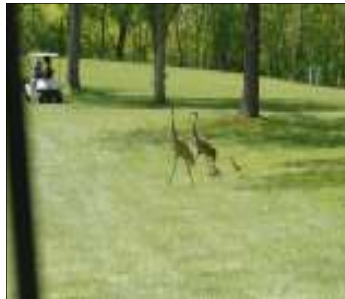
Golfers pause in their cart while a pair of herons escort their chicks from the woods to Mud Lake on the golf course.