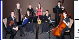
Clay High School Strings performed for guests