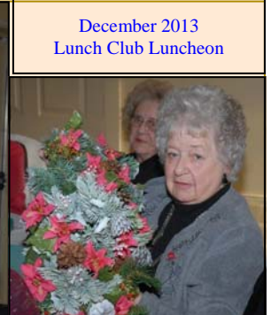
December 2013 Lunch Club Luncheon