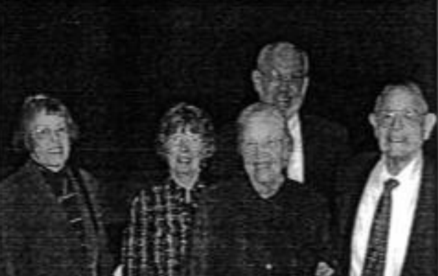
VISIT THE HALL OF FAME GALLERY IN THE SOUTH HALL OF CENTURY CENTER.