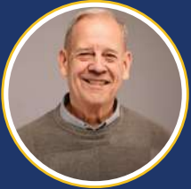
Steve Luecke Former Mayor of South Bend